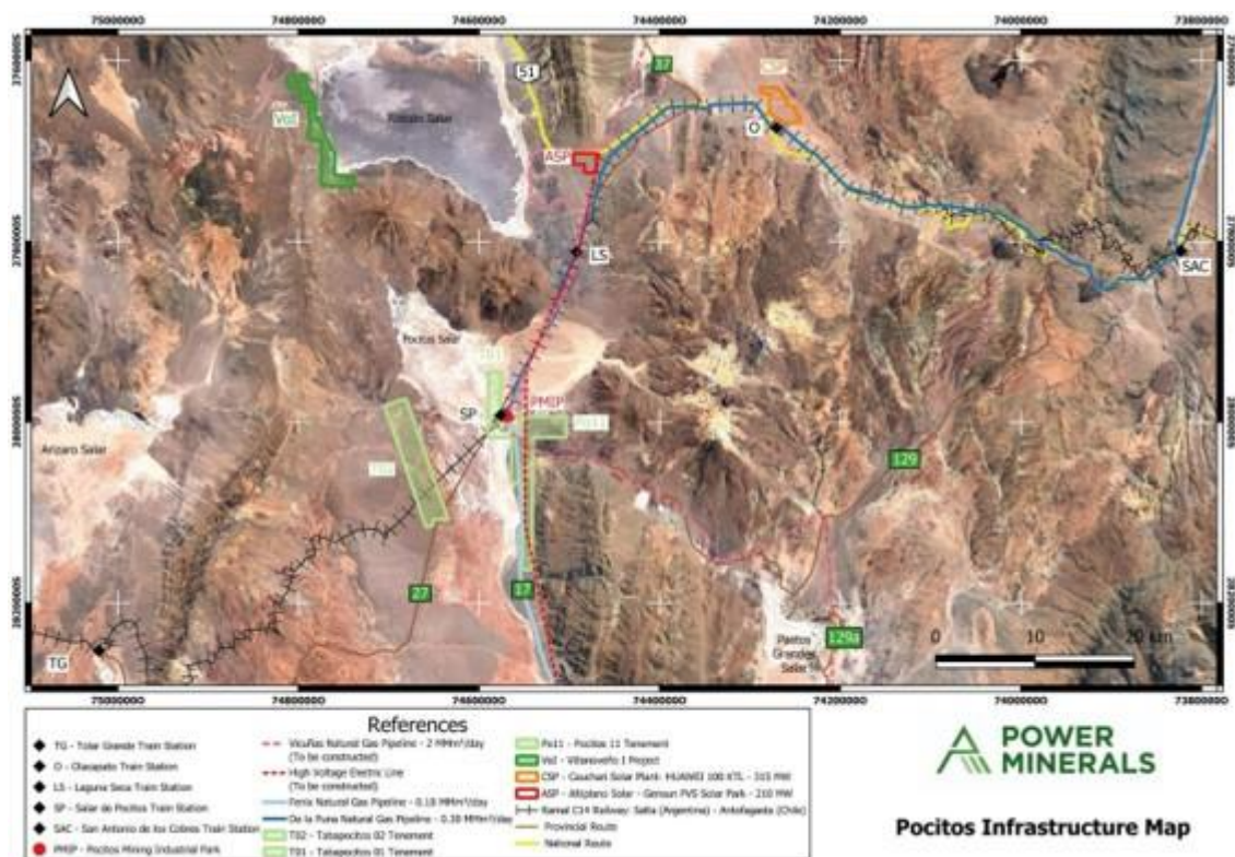
Figure 1: Power's Rincon and Pocitos projects, demonstrating key infrastructure near Pocitos

The project is further strengthened by ongoing infrastructure improvements, including paving of highway Route 27, a planned high-voltage electrical connection from Cauchari, and a 435-hectare industrial park at Pocitos, which is already in limited use by industry players.