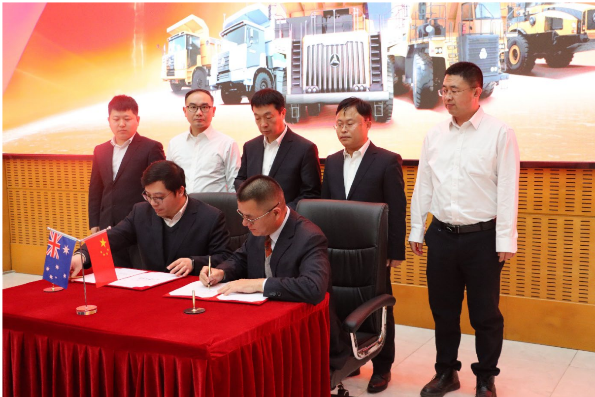
Figure 1: SANY and Aurum signing MoU in Shenyang, China, SANY's heavy equipment manufacturing base