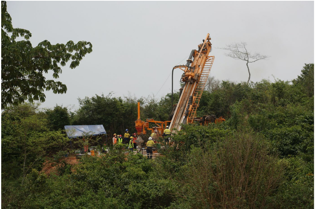
Infill drilling underway at the Ewoyaa South 2 deposit