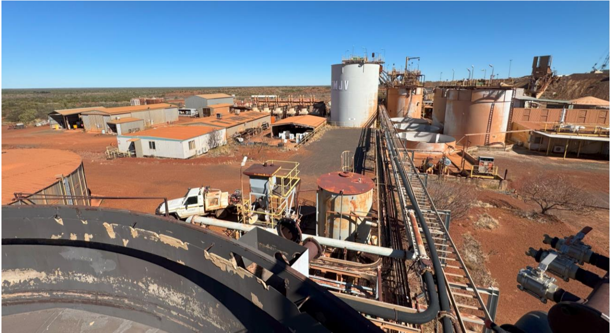
Figure 2 CTPJV 1.2 Mtpa Processing Plant (idle since 2005, requires refurbishment)

In addition, an engineering review will be required to define the optimum processing and infrastructure options for re-establishing production within the CTPJV. This includes assessment of both new build and full or partial refurbishment of the existing CTPJV processing plant which has been idle since 2005.