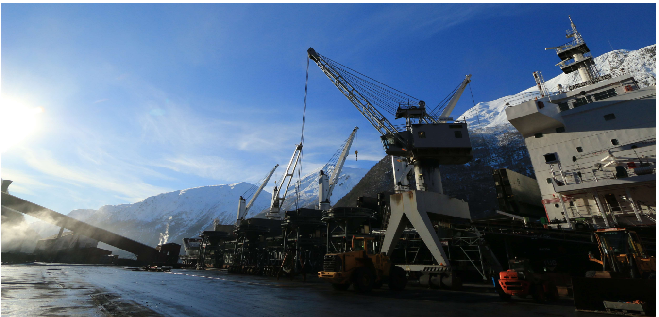
TiZir Titanium & Iron ilmenite upgrading facility, Tyssedal, Norway

As previously disclosed, it is anticipated that the upgraded furnace and water-cooled copper-ceramic roof will increase smelting capacity by approximately 15% and improve maintenance performance by lengthening periods between scheduled shutdowns.