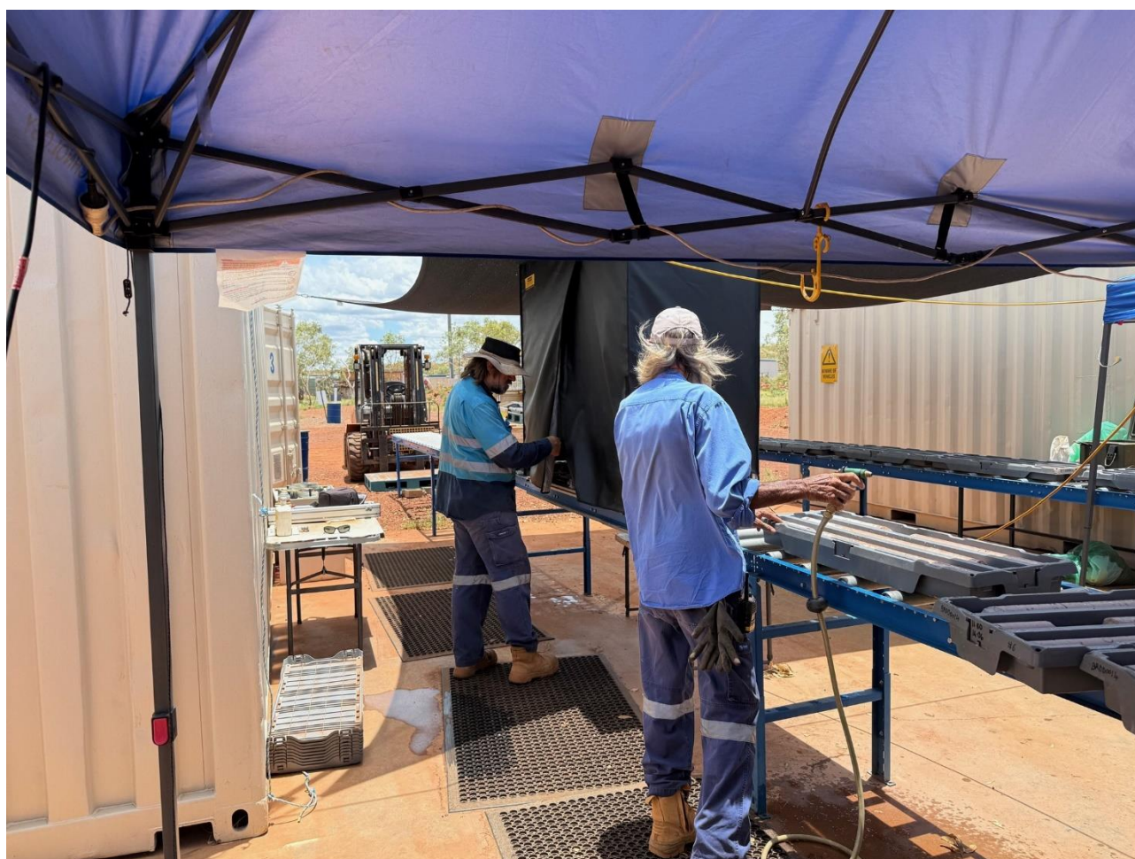
Figure 1: Dazzler Diamond Drilling EIS program core processing Feb 2025