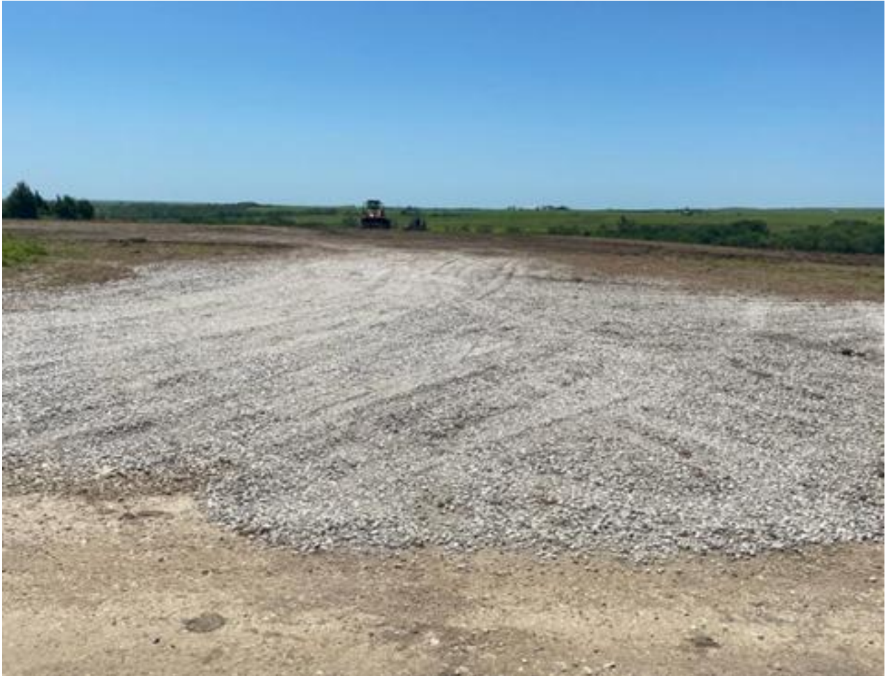
Figure 1: McCoy 1 lease being prepared for the mobilisation of Rig 116

After a planned crew break, the Murfin Rig 116 will mobilise to McCoy 1 following some routine maintenance. Depending on the time required to perform this work, McCoy 1 is expected to spud in early July. Having a break with the field crew avoids crew change out and maintains continuity across the entire exploration campaign allowing for operational efficiencies to be developed.