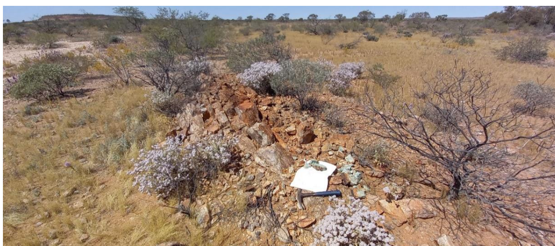
Figure 4. VMS base-metal target; exhalative malachite, chalcocite, and galena-bearing barite lens. (Sample# ZEU016; See Figure 3).

Prior to drilling, detailed mapping conducted on site defined a further four exhalative barite lenses showing indications of copper mineralisation, extending the known strike length to over 300m. Mapping indicates the deposit is highly sheared with more competent barite lenses forming elongate lobes, stringers, and pods.