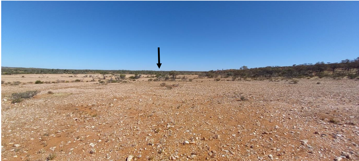
Figure 7. Extensive quartz sheetwash blanket covering the metamorphosed contact between the vegetated Thirty-Three Supersuite granitoids (RHS) and metasedimentary country rock. Arrow pointing to the location of the Pegmatite Creek prospect (see Figure 6).

The prospective zone extending outwards from the margins of the prospective granites into the host metasediments is largely obscured by an extensive blanket of quartz sheetwash (Figure 7) derived from weathering of the granitoid. Further reconnaissance mapping by Zeus has identified a zone of extensive outcropping pegmatites along a creekline (now referred to as 'Pegmatite Creek') where the sheetwash blanket has been removed by erosion (Figure 8).