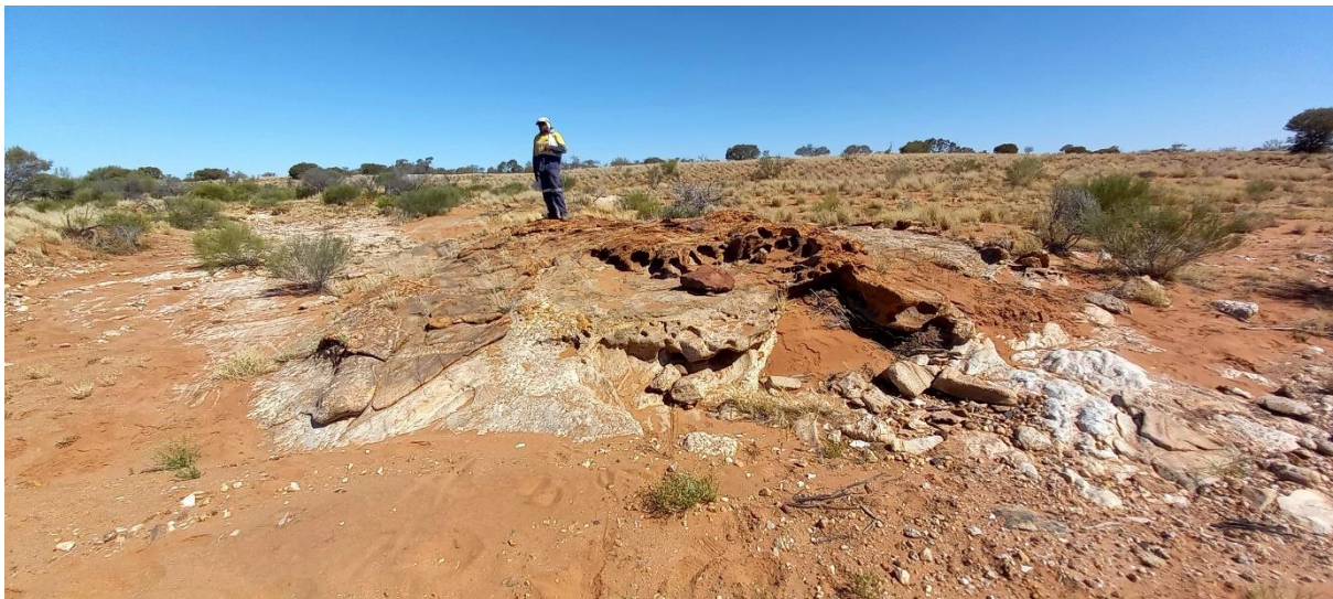
Figure 8. Pale-coloured pegmatite intruding reddish brown pegmatitic granite.

The prospective zone extending outwards from the margins of the prospective granites into the host metasediments is largely obscured by an extensive blanket of quartz sheetwash (Figure 7) derived from weathering of the granitoid. Further reconnaissance mapping by Zeus has identified a zone of extensive outcropping pegmatites along a creekline (now referred to as 'Pegmatite Creek') where the sheetwash blanket has been removed by erosion (Figure 8).