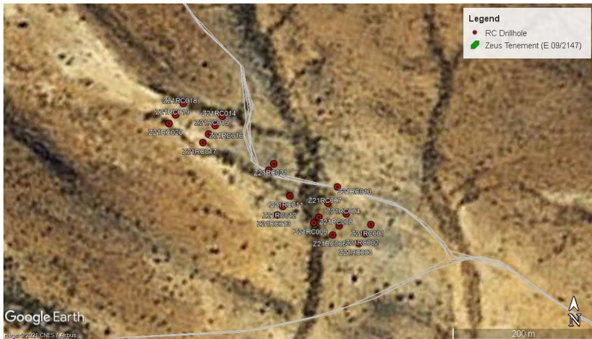
Figure 6. Reid Well drillhole locations.