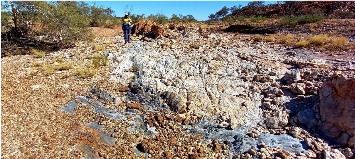
Figure 9. Pale-coloured pegmatite intruding greenish grey chloritic schists on the margins of the Thirty-Three Supersuite

Zeus considers the identification of prospective pegmatites at Pegmatite Creek, a short distance along strike from a known a Lithium-Caesium-Tantalum (LCT) pegmatite mineral system to be highly encouraging.