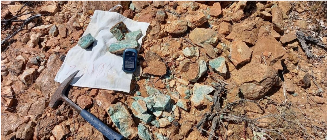
Figure 5. Detail of mineralised outcrop. (Sample# ZEU016 = 1.4% Cu, 0.19% Pb, 125 ppm Zn & 18.4 ppm Ag)