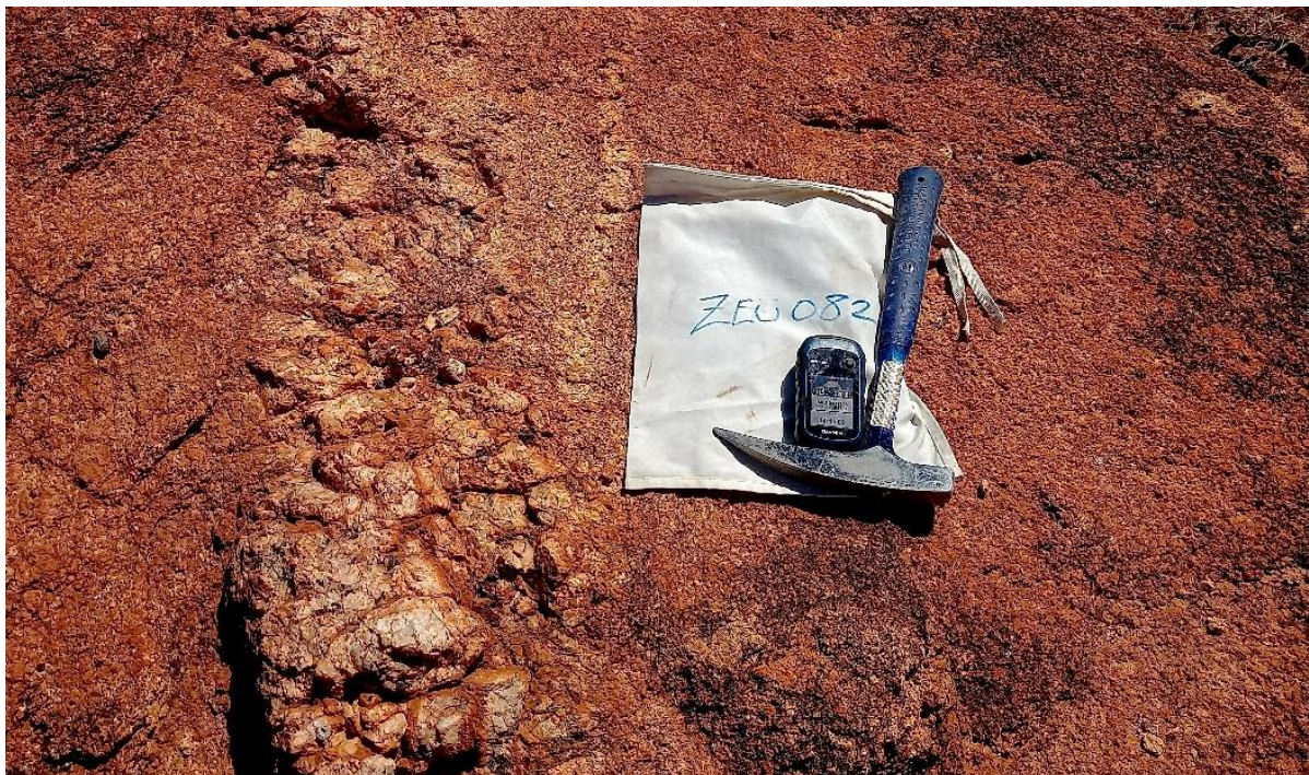
Figure 10. Quartz-feldspar-tourmaline pegmatite intruding Thirty-Three Supersuite granite.

Follow up airborne and ground surveying is being planned for early 2022 to target the the lithium 'sweet spot' lying 500 to 3,000m outboard of the parent granitoid.