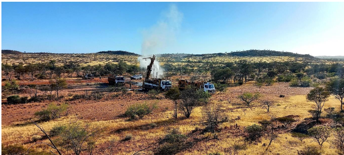
Figure 3. Drilling operations at the Reid Well Base Metals Prospect.

Field work conducted during Q4 2021 is completed. Work comprised RC drilling of 22 holes at the Reid Well Base Metal Prospect and further reconnaissance mapping and sampling to investigate the potential of the tenement to host pegmatite lithium mineralisation.