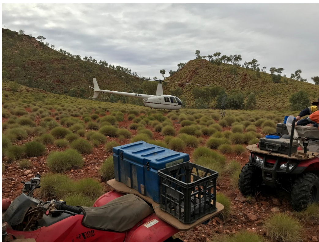
Figure 2 – Photographs of recent exploration activities at Mt Mansbridge