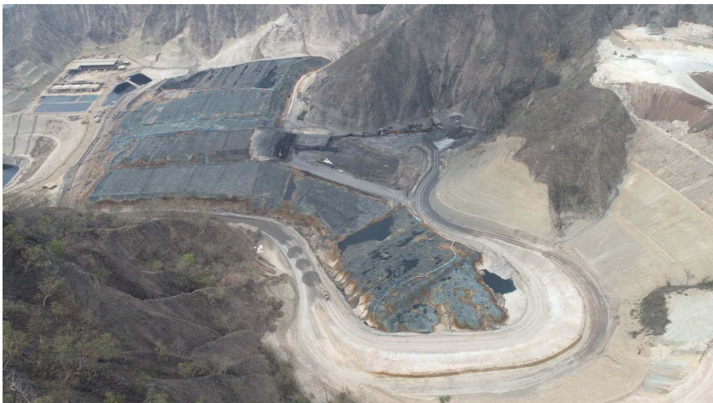
Figure 2 – Kali Kuning Valley leach pads with extension works underway.

Works have also commenced to extend the heap pads in the Kali Kuning Valley at KK1/2 and KK06 areas.