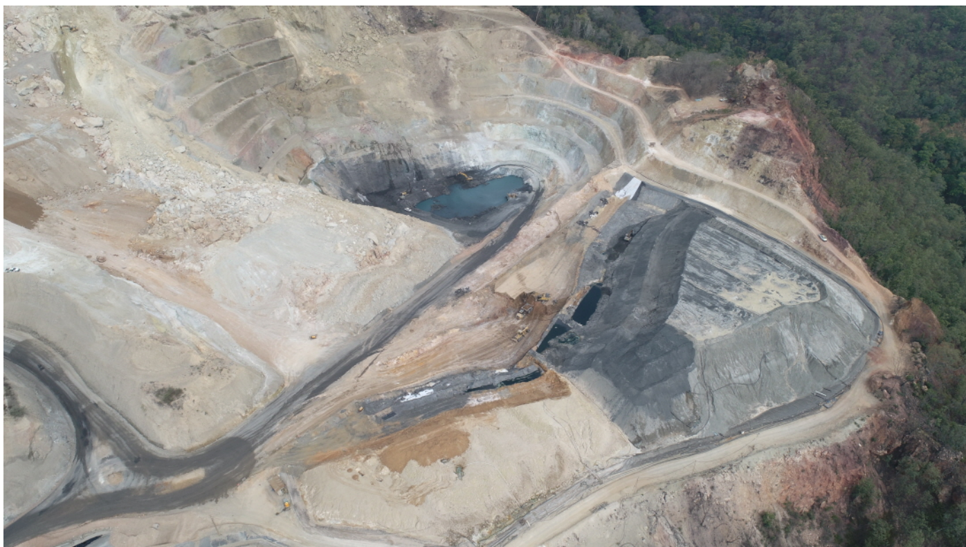
Figure 1 – View of the Kali Kuning pit as at 7 October with pit wall failure remediation works in progress

A second major slip occurred on the north wall of the Kali Kuning pit (ASX announcements 3 October 2018 and 18 June 2018). Remediation works to remove approximately 300,000 bcm of waste have commenced and are expected to be completed over the fourth quarter. This additional waste movement may reduce the ore mined over the December quarter by 10%, however, it is not expected to lead to any delays to the commencement of the 2019 mine plan. No injuries were sustained during this incident. The Stage 6 cutback of the Kali Kuning western wall has commenced to facilitate access to ore in the Kali Kuning pit during the slip remediation works.