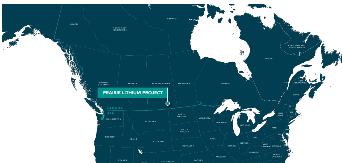
Figure 2: Location of the Prairie Lithium Project in Saskatchewan, Canada

AZL’s Prairie Lithium Project is located in the Williston Basin of Saskatchewan, Canada. Located in one of the world’s top mining friendly jurisdictions, the projects have easy access to key infrastructure including electricity, natural gas, fresh water, paved highways and railroads. The projects also aim to have strong environmental credentials, with Arizona Lithium targeting to use less use freshwater, land and waste, aligning with the Company’s sustainable approach to lithium development.