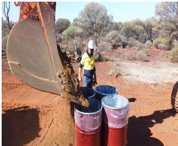
Mt Kilkenny bulk sample collection and storage

Sub-samples were collected from each drum and prepared for analytical analysis at SGS Perth by X-ray Fluorescence (XRF) as detailed in table 1. Sufficient drums to make a 600kg sample containing a geochemical composition that resembled the expected LOM grades were selected for use in the closed-circuit testing program. The contents of the selected drums were crushed to the required ore feed size of minus 50mm and homogenised prior to being agglomerated with 98% sulphuric acid and loaded into the columns for leaching.