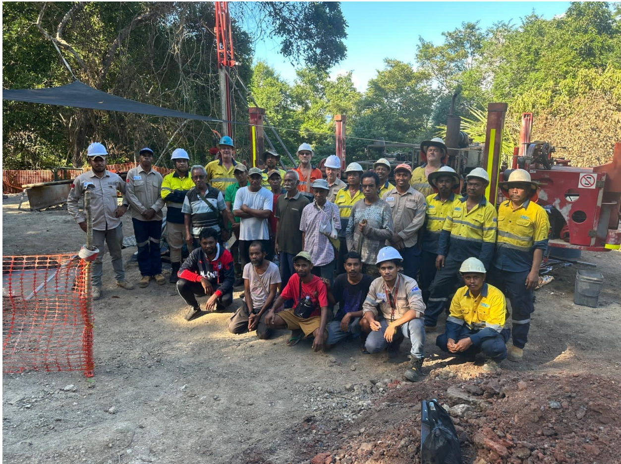
Figure 5: Exploration team at site, which includes Ira Miri locals as well as representatives from Estrella and CoreSearch

Figure 5 below shows the current exploration partnership team (Estrella and CoreSearch) along with Ira Miri locals who have been employed on the project to fill various functions from site security to light track clearers and local guides. It has only been 6 months from initial discovery to drilling, in a country where no exploration drilling capability existed. Estrella wishes to thank all those involved in its exploration efforts to date.