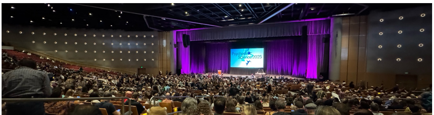
Figure 1: Main Presentation Stage at PS25

Globally, funding remains one of the largest barriers to scaling resource-intensive psychotherapy models. Emyria's model demonstrates how real-world data, ethical care delivery and collaboration with insurers can create sustainable funding pathways.