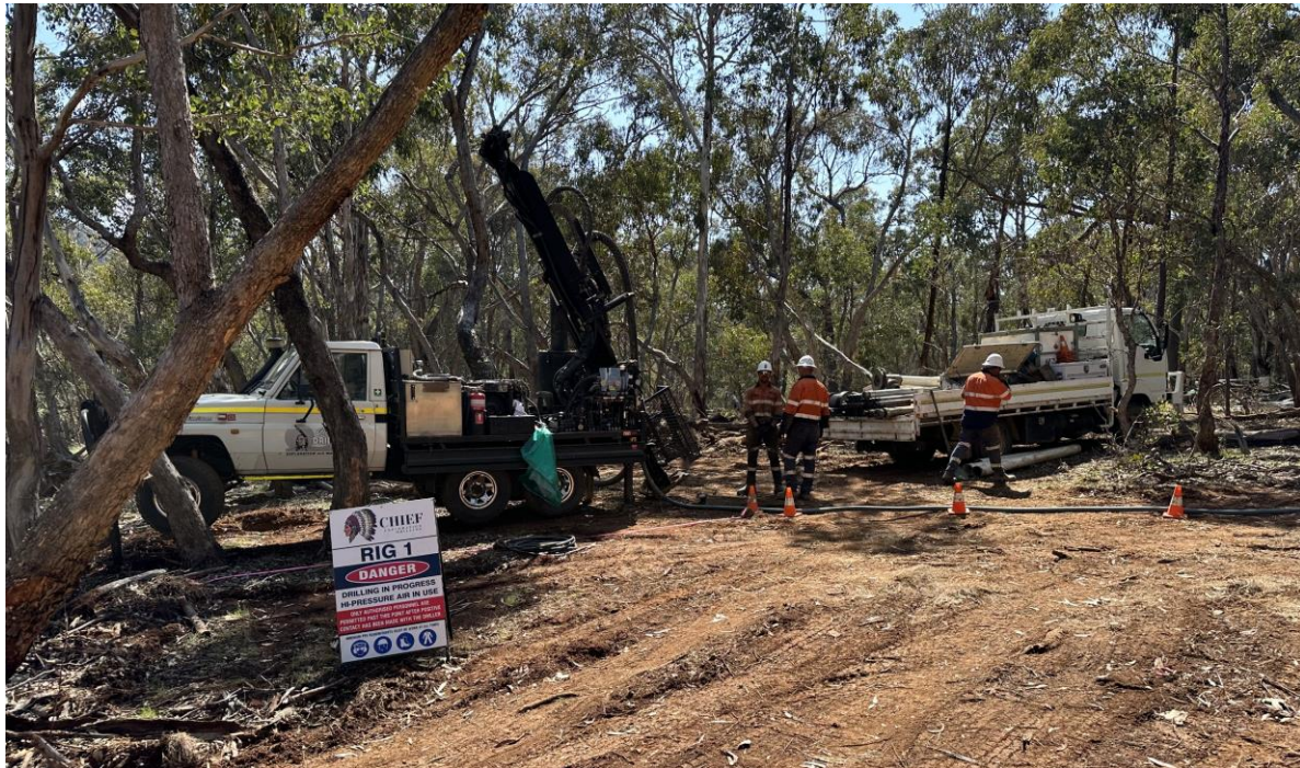
Figure 1 – RC Drill Rig on site over the Kempfield NW Zone