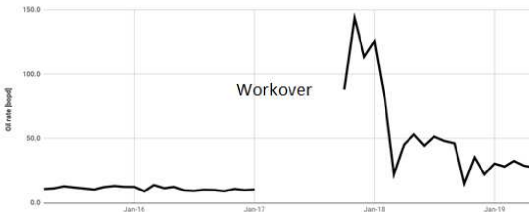
Paradox Oil 34-31 Production

Hawkley is also proposing to carry out a workover and recompletion of an existing well using a strategy that has already been successfully applied. The total cost for this is estimated at US$1.8M, with Hawkley's share being US$630k. The process involves casing a preferentially selected one mile lateral in the existing birdsfoot open hole design, then a 20 stage slickwater frac. A similar recompletion of the Paradox Oil 34-31 well resulted in oil flow increasing to about 100BOPD for three months before reducing to 50BOPD then slowly declining as shown below: