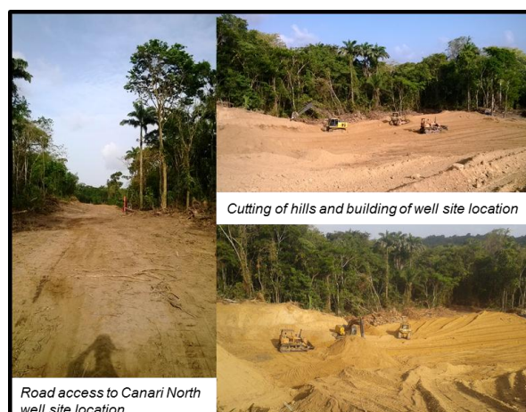
Canari North well site preparations

Range looks forward to updating the market on commencement of operations.