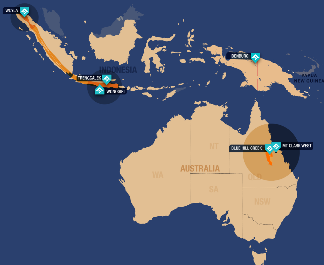
Figure 1: Map showing location of FEG projects in Indonesia and Australia.