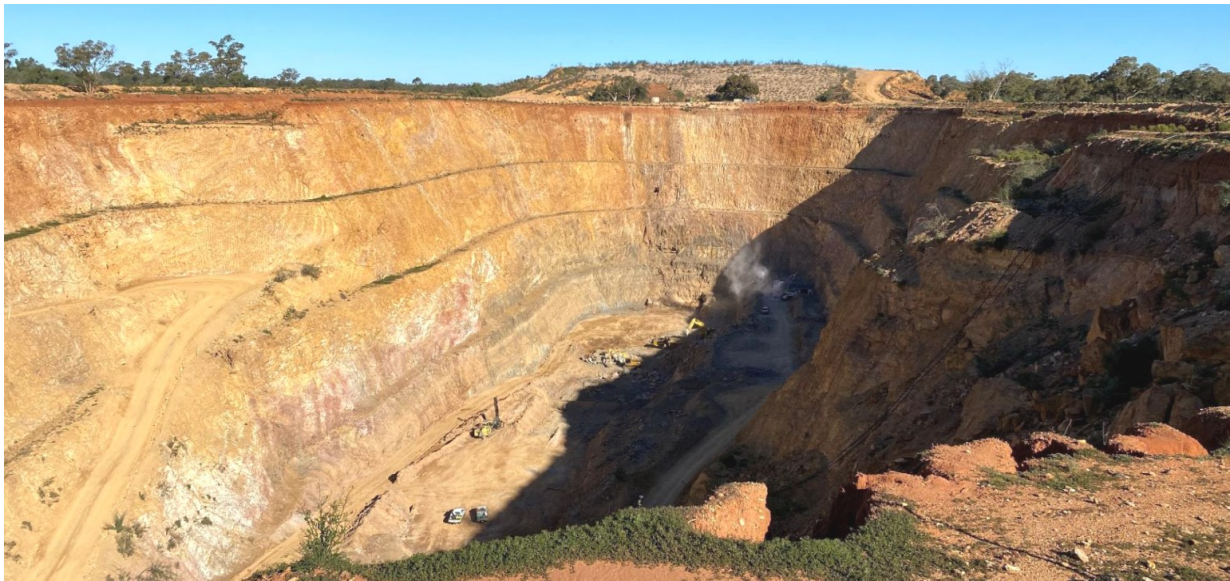
Figure 1: High Grade Open Pit Mining at Mt Boppy by Manuka in 2020-2021.