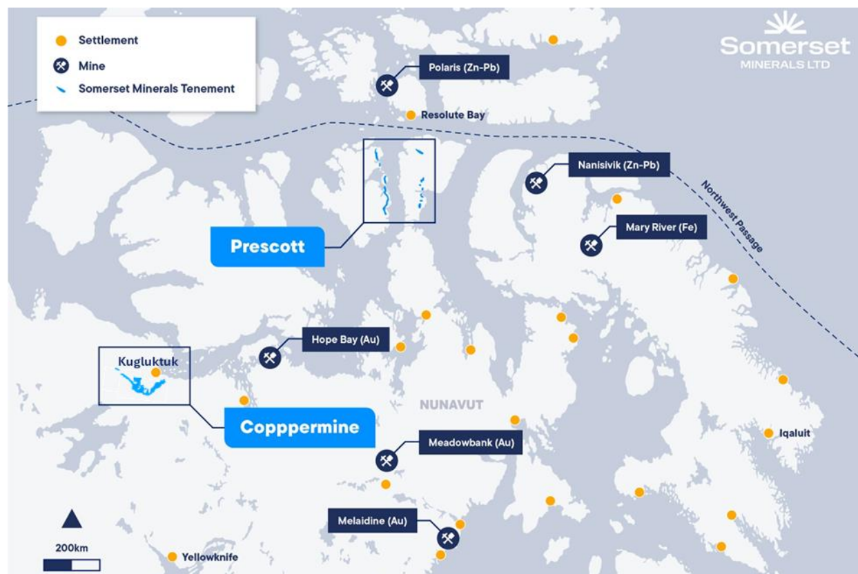
Figure 2. Overview Somerset project locations and mines in Nunavut.

The Coppermine Project is located in the Kitikmeot region of Nunavut and consists of 102 exploration licences and one exclusive exploration right executed with Nunavut Tunngavik Incorporated (NTI), covering 1,665km 2 , serving to position Somerset as the largest landholder in the Coppermine region. Importantly, over 90% of the Company's tenure comprises the Copper Creek Formation basalts, which hosts high-grade copper mineralisation.