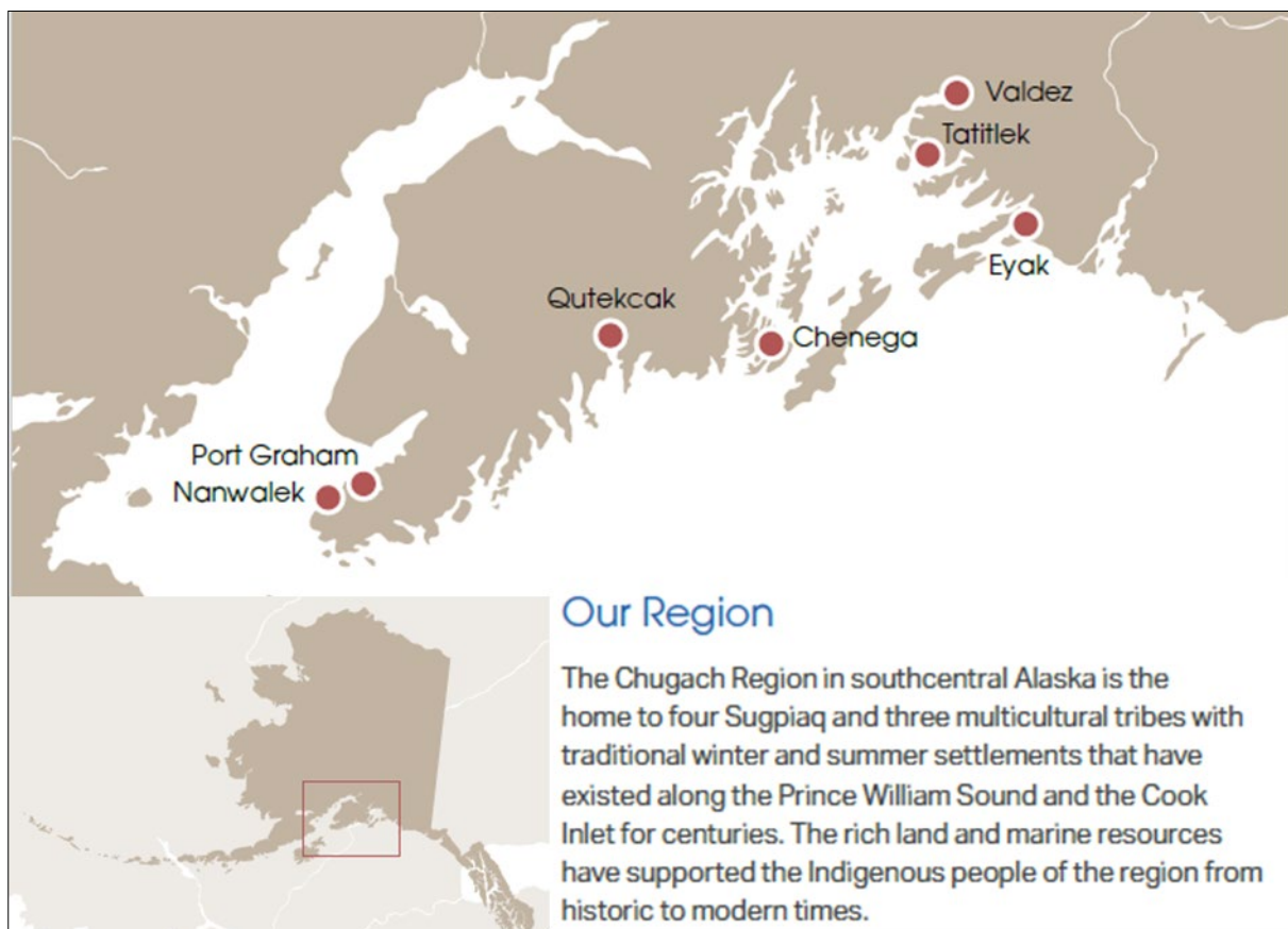
Chugach Region of Alaska

As a technology provider, Carnegie is well placed to work alongside local experts at Chugachmiut to investigate opportunities for future CETO wave energy projects. This MOU formalises ongoing discussions and demonstrates the parties' commitment to active collaboration towards the deployment of wave energy in the region.