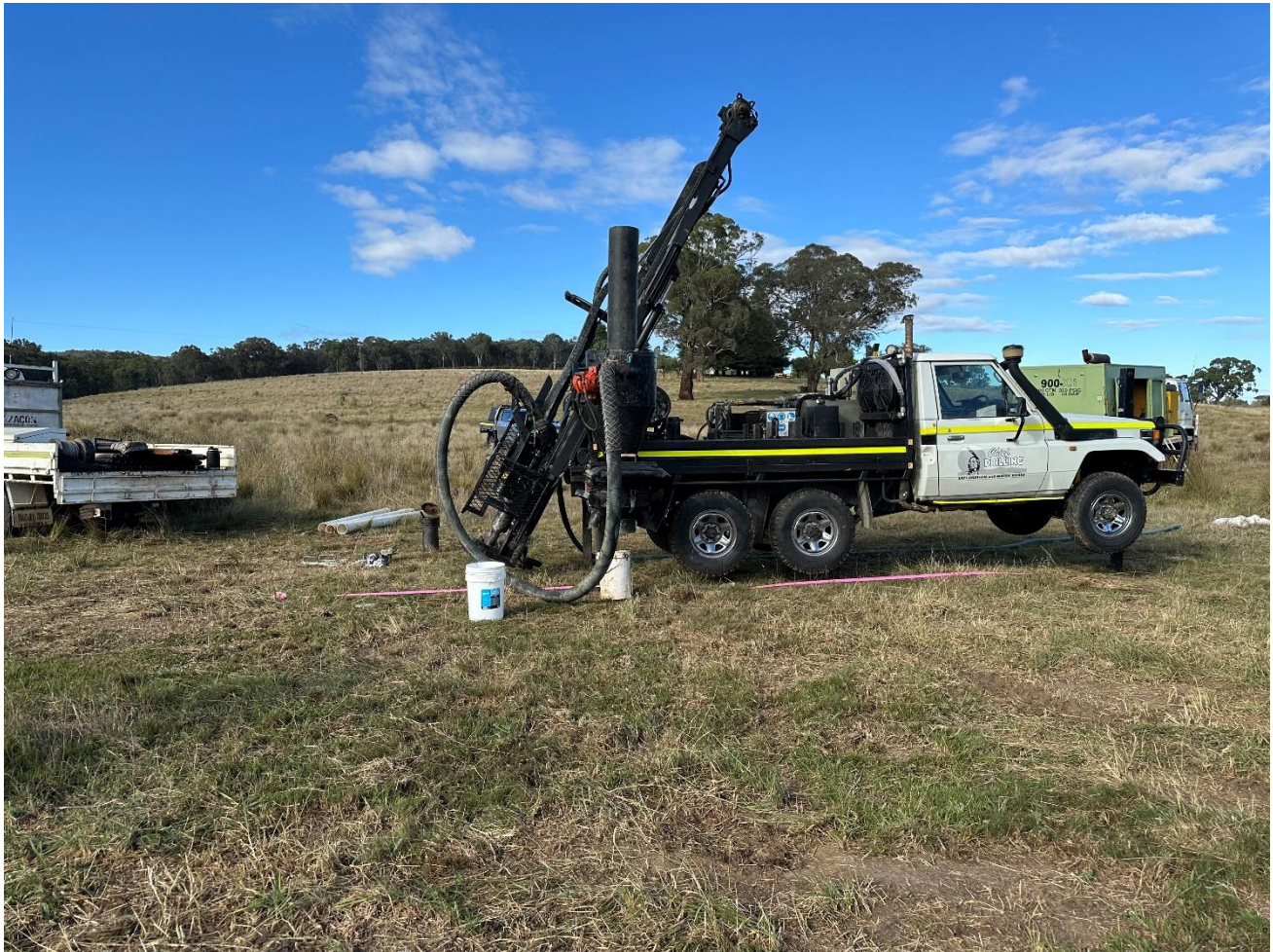
Figure 2 – RC Drill Rig commencing the drilling of the first hole

ASX announcement has been authorised for release by the Board of Argent Minerals Limited.