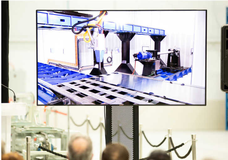
Launch of Large-Scale Metal 3D Printer