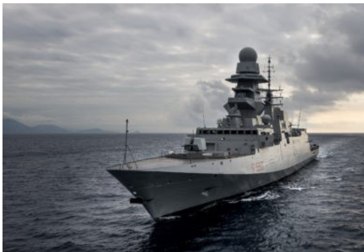
Titomic signs MST agreement with Fincantieri