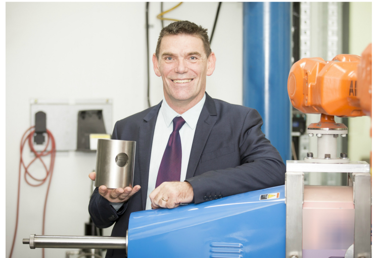
Titomic's huge Aussie 3D printer will use a year's global supply of powdered titanium