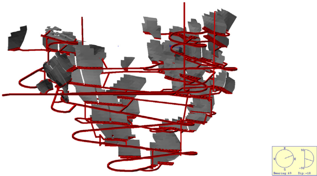
Figure 2: Tuvatu Mine Plan