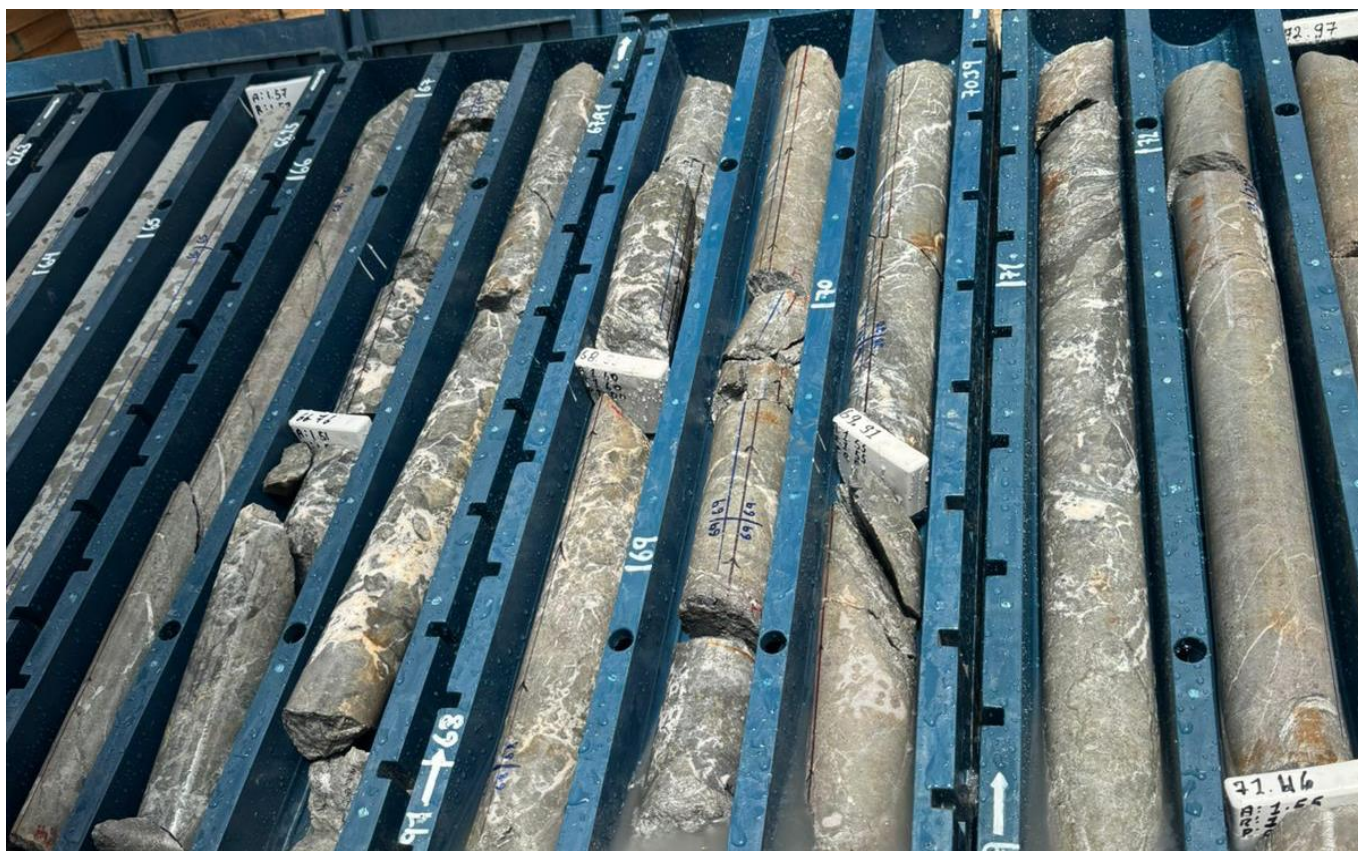
Plate 1: Diamond drill core from Iguana east displaying a breccia zone.