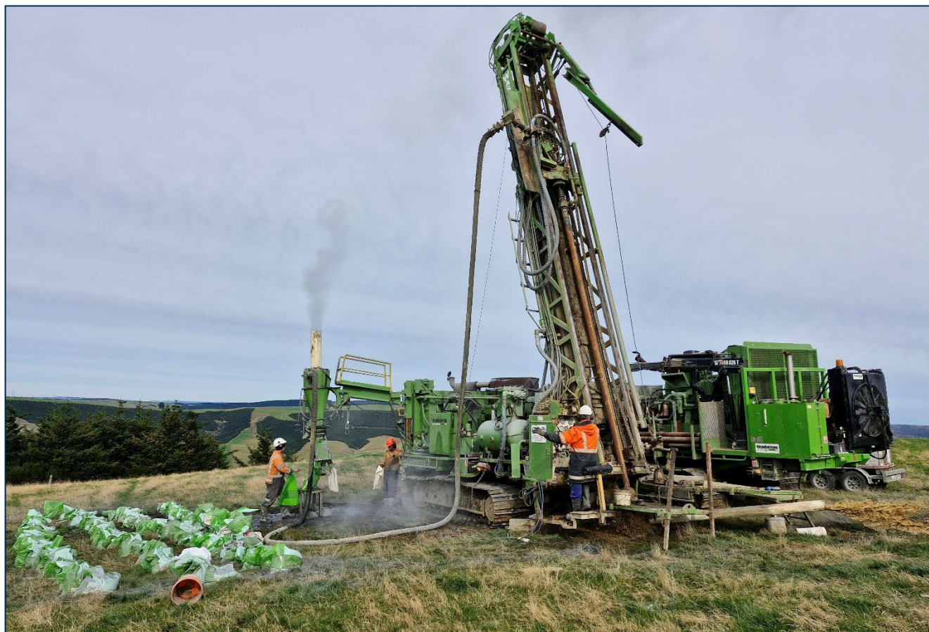
Figure 3: Photo of RC drilling operation on Waipori Station