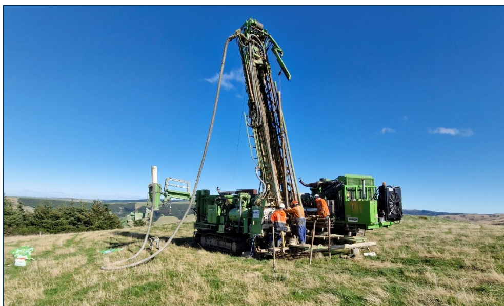
Figure 2: Photo of RC drilling operation on Waipori Station