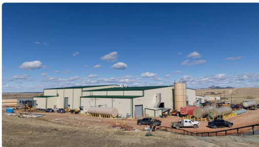
Central Processing Plant (Phase I & II)