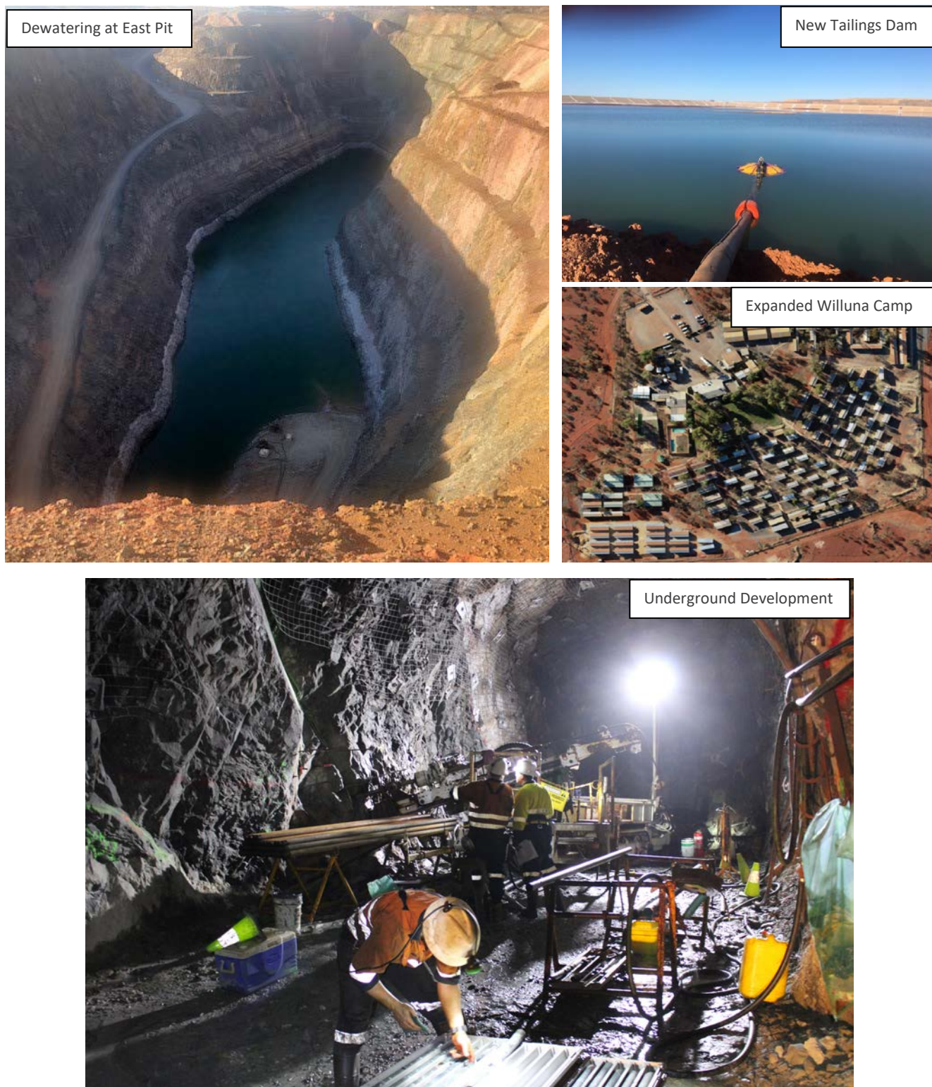
Figure 2- Photos of various Infrastructure updates