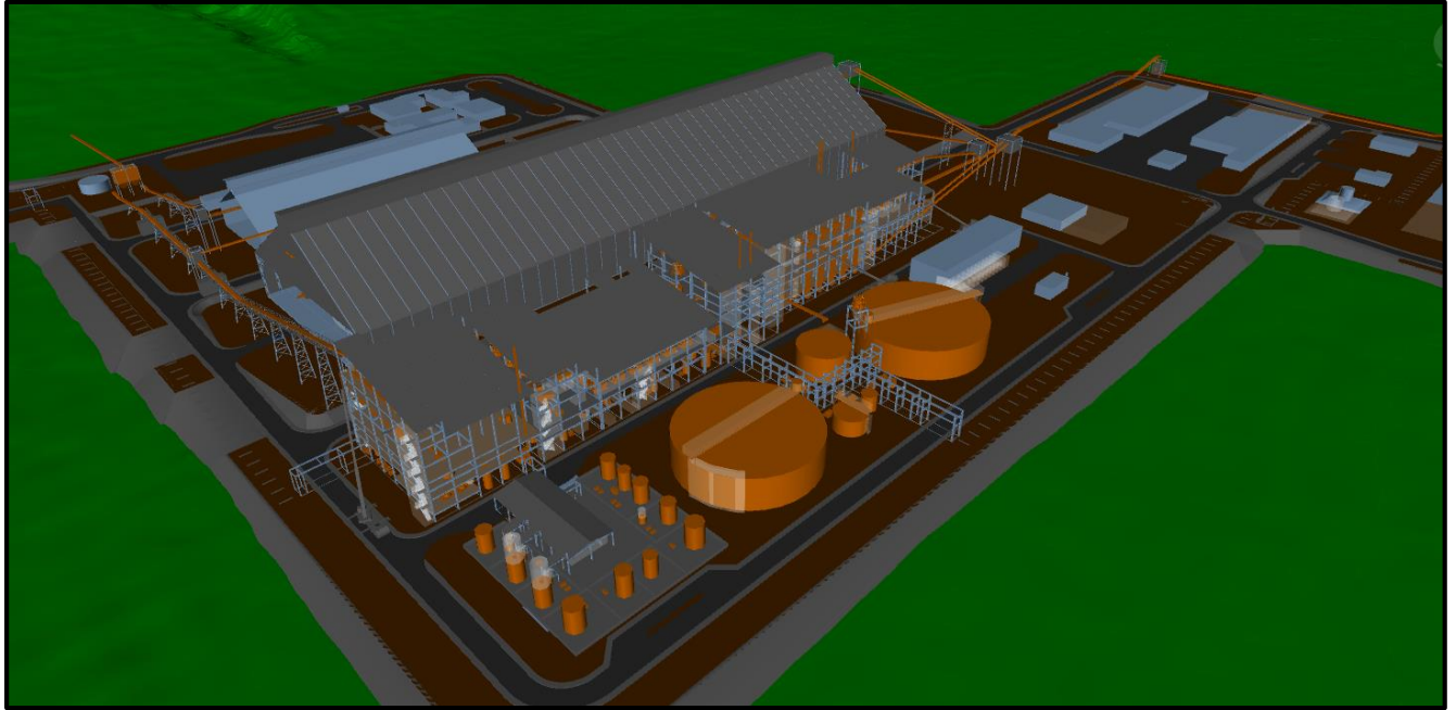
Figure 1: Process plant area model