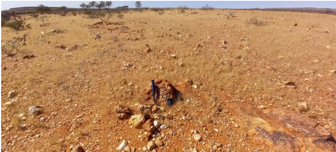
Figure 6. Subcropping quartz-albite-tourmaline pegmatite developed on the margins of the fertile Thirty-Three Supersuite granite. Location of Sample # ZEU007 (7ppm Li, 9.42 ppm Cs, 456 ppm Rb).

Nonetheless, multi-element assay of the parent granitoids indicate they are moderately enriched in Caesium and Rubidium.