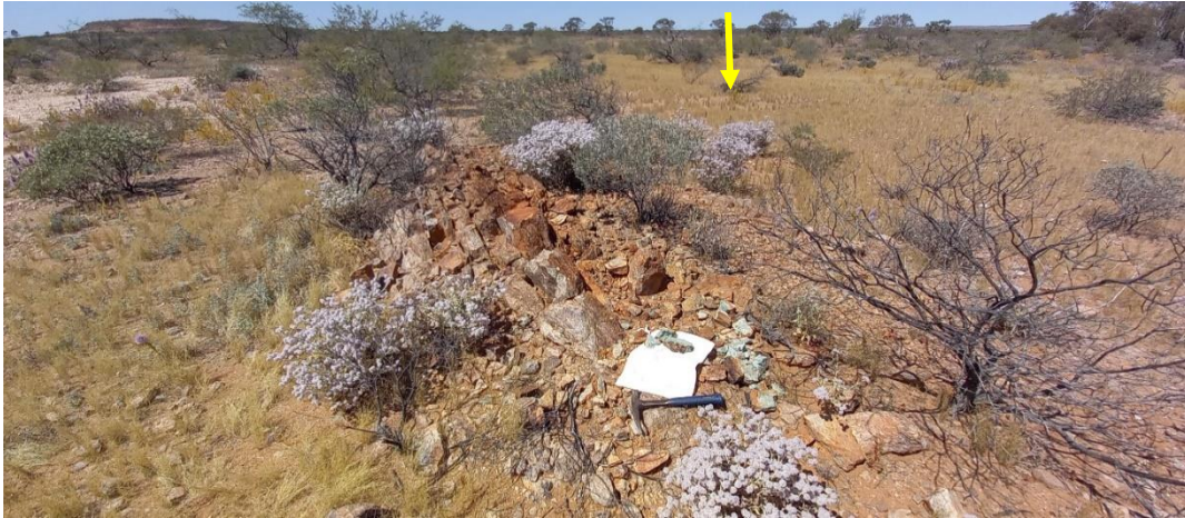
Figure 2. VMS base-metal target; exhalative malachite, chalcocite, and galena-bearing barite lens. (Sample# ZEU016; See Figure 3).

High-grade mineralisation was identified at a smaller fault-offset lobe further west across the creek. Sample ZEU004 returned high-grade including 10.90% Cu, 6.04% Pb, 150 ppm Zn & 195 ppm Ag.