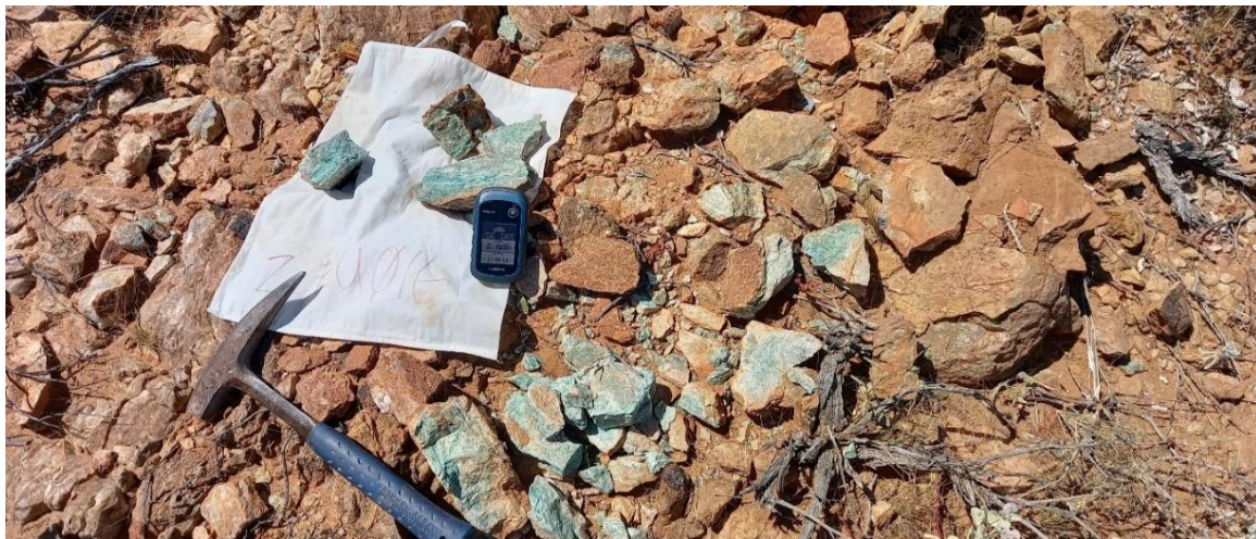
Figure 3. Detail of mineralised outcrop. (Sample# ZEU016 = 1.4% Cu, 0.19% Pb, 125 ppm Zn & 18.4 ppm Ag).

3 historic drill collars were located by Zeus along with the remains of historic trenching and a large block of gossanous material (after sulphide) is observed within trench spoil. Siliceous carbonate sinters occur in close proximity to the south.