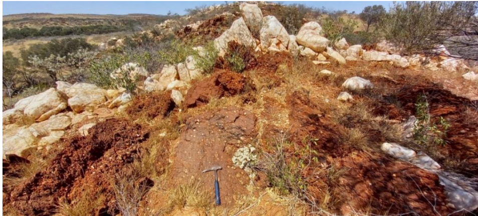
Figure 7. High-strain quartz-pebble conglomerate crosscut by late-stage quartz veining

Assay results indicated the quartz-pebble conglomerates, and the cross-cutting (late-stage) dilational quartz veining did not contain any appreciable gold anomalism.