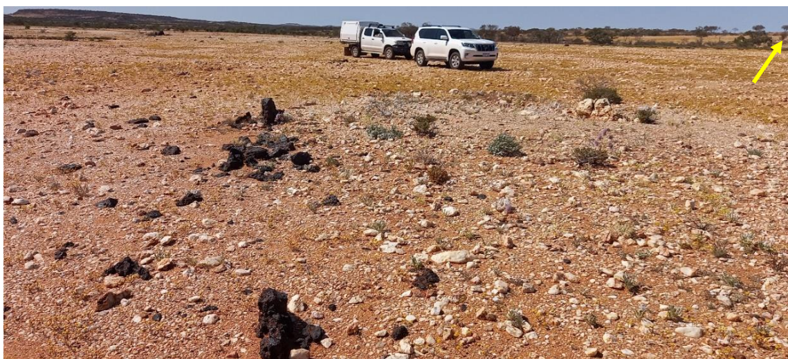
Figure 5. Zone of extensive sheetwash comprised of quartz and black eluvial gossanous material developed along the margins of the Thirty-Three Supersuite granitoids. Arrow pointing to location of pegmatite identified in Figure .

Multi-element assays of the parent granitoids on Zeus' tenement indicate it is moderately enriched in rubidium suggesting that the parent granitoids are likely to be lepidolite-prone.