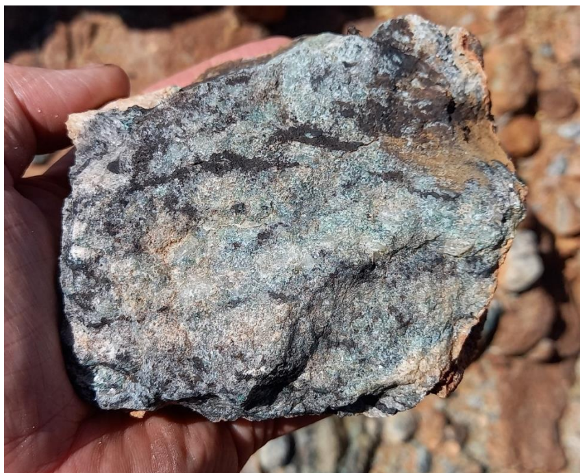
Figure 4. Chalcocite, malachite, and galena bearing barite. (Sample # ZEU021 = 2.34% Cu, 10.9% Pb, 115ppm Zn & 90.6 ppm Ag).

mineralisation confirmed as Li-bearing spodumene. Lepidolite was also identified within two proximal drill holes at the T-Bone prospect (Segue Resources ASX Announcement, 09 Oct 2017).