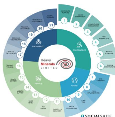
Figure 2: World Economic Forum Governance Metrics

The baseline assessment is complete and will be further advances as the study phases progress.