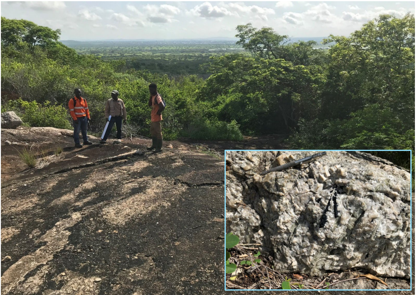
Figure 3: View looking north-east towards Bewadze licence and flat planes in the distance, with coarse spodumene pegmatite mineralisation underfoot; insert close-up of spodumene crystals (green) with tourmaline (black).