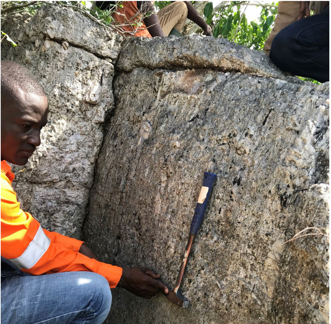
Figure 4: Spodumene-rich pegmatite outcrop on Egyasimanku Hill with spodumene crystals (green) evident parallel to the direction of hammer handle throughout the outcrop.