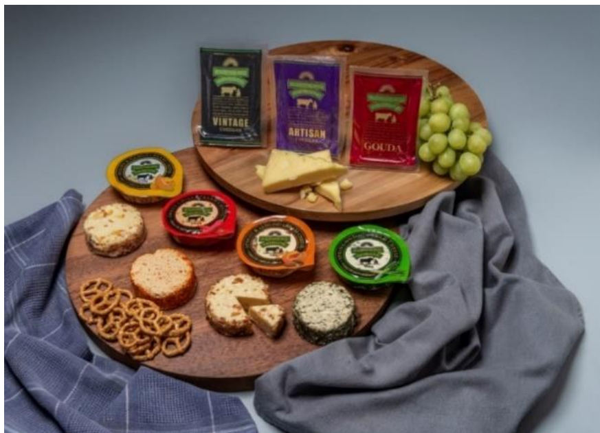
Figure 2: Farmers Tribute Range – Including Vintage Cheddar, a multi-time winner of the best cheddar cheese in Australia at the Grand Dairy Awards.