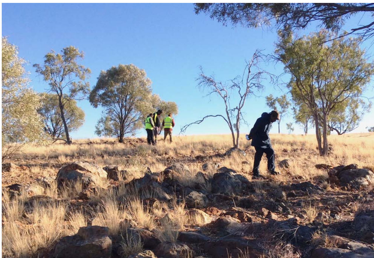
FIGURE: Traditional owner representatives of the Bularnu Waluwarra Wangkayujuru (“BWW”) conducting a cultural heritage survey at the Ardmore site.

The results were reported under JORC 2012 and Centrex is not aware of any new information or data that materially affects the information contained within the release. All material assumptions and technical parameters underpinning the estimates in the announcement continue to apply and have not materially changed.