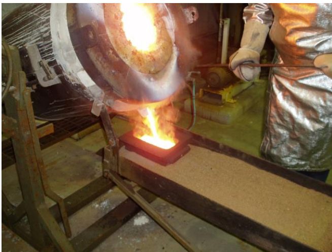
Figure 1: Pouring Doré Gold Bar AYC001

The Company has commenced ore processing using low-grade stockpiled ore at the Maldon treatment plant and is pleased to advise that the recommissioning of the mill has occurred without incident and that the mill is operating as designed and meeting forecast throughput rates.