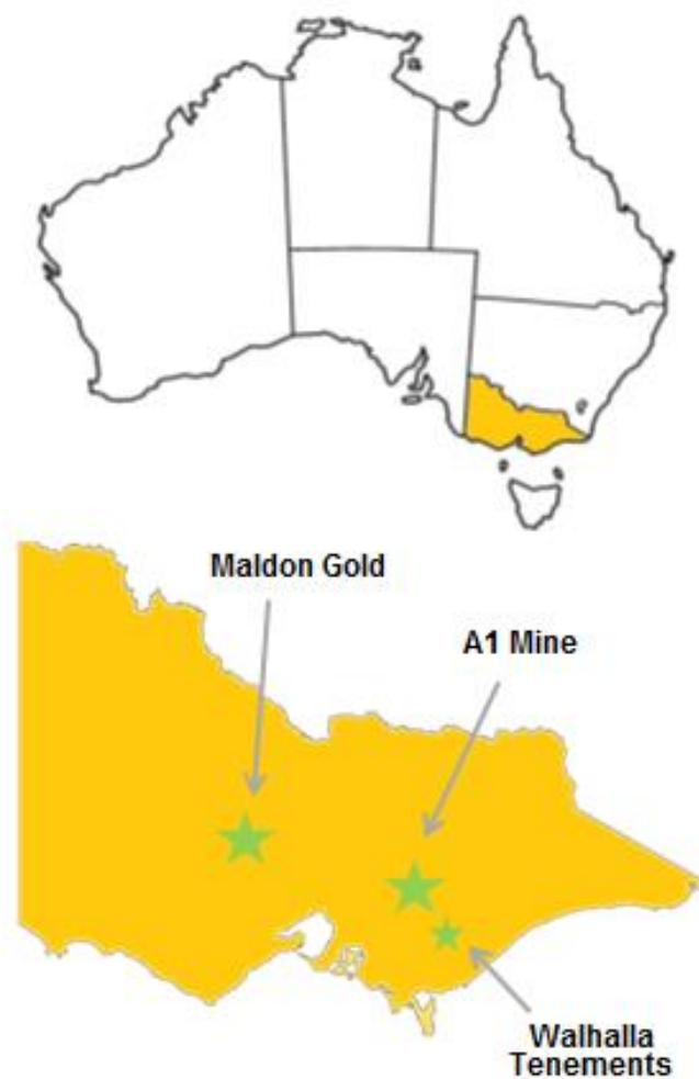
Figure 4: Location of Projects

As announced on 29 December 2014, the Company has executed a Share Sale Agreement with Octagonal Resources Limited (ASX:ORS) to acquire Octagonal's Victorian assets, which includes a fully permitted 150,000 tpa gold processing facility at Maldon.