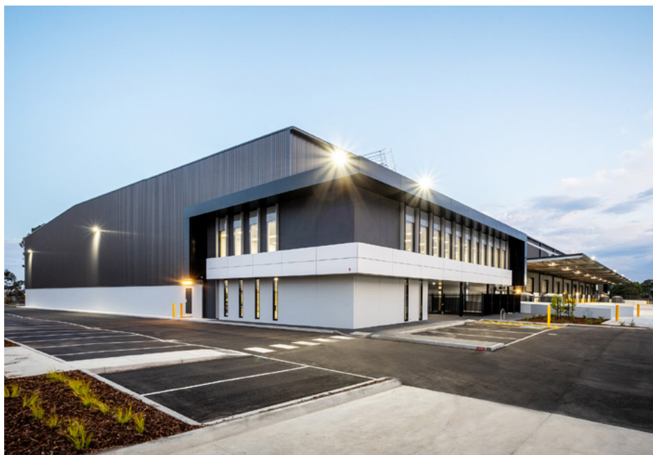
Keylink Estate – North, Keysborough, VIC