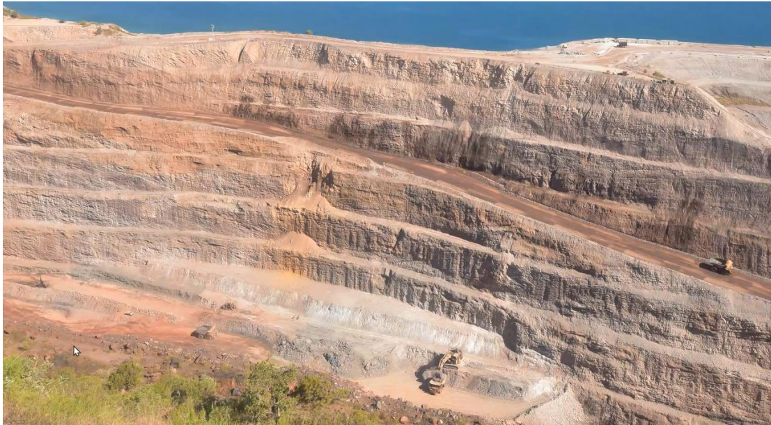
Figure 2: Extraction of the former eastern haul-ramp in the Main Pit in early July 2025. This work is scheduled for completion in the September 2025 quarter.

Mining, logistics and administration costs reduced 11% on the prior quarter from $27.42 per tonne of ore and waste mined in the March 2025 quarter, to $24.27 per tonne mined in the June 2025 quarter.