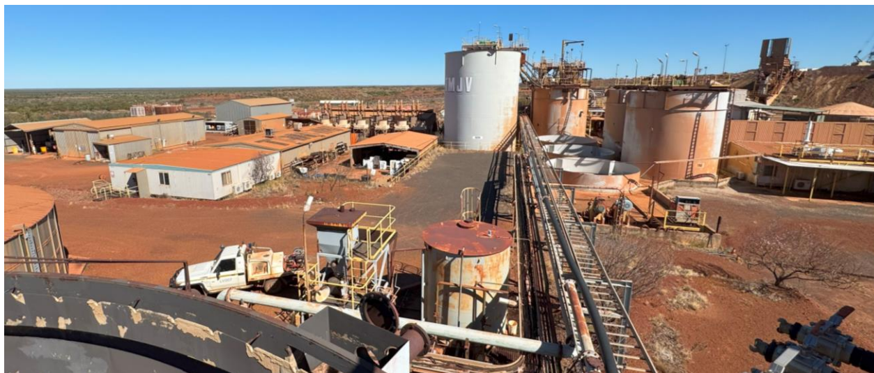
Figure 3: CTPJV 1.2 Mtpa Processing Plant (idle since 2005, requires refurbishment)

The CTPJV assets comprise over 2,100 sqkm of mining and exploration tenements in the Central Tanami region of the Northern Territory, hosting significant gold resources of more than 1.6 million ounces (Moz) with strong potential for increases through further drilling. Infrastructure assets within the CTPJV include a non-operating 1.2 Mtpa carbon-in-leach processing plant which presents a refurbishment option for future project development, as well as haul roads, an accommodation camp, bore field and gravel airstrip.