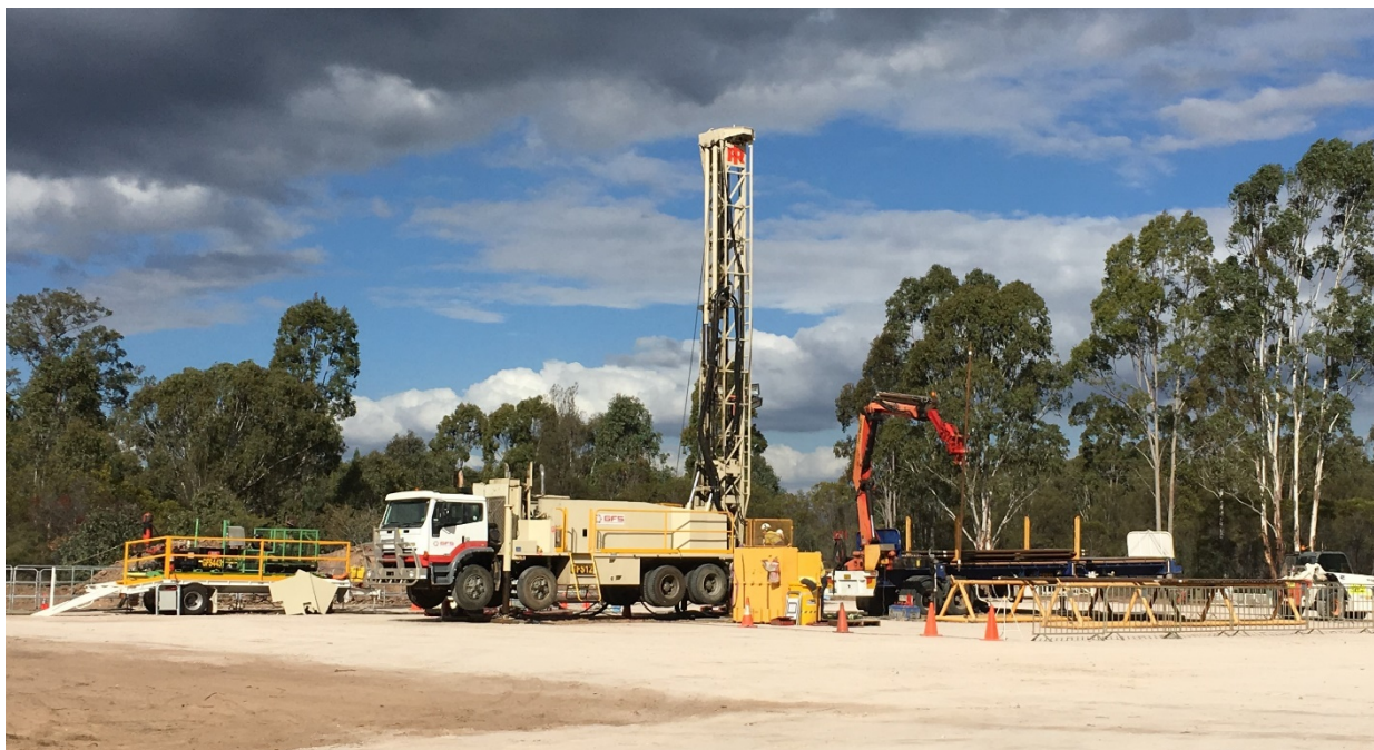
Figure 1: GFS Rig 12 on location at Range 4