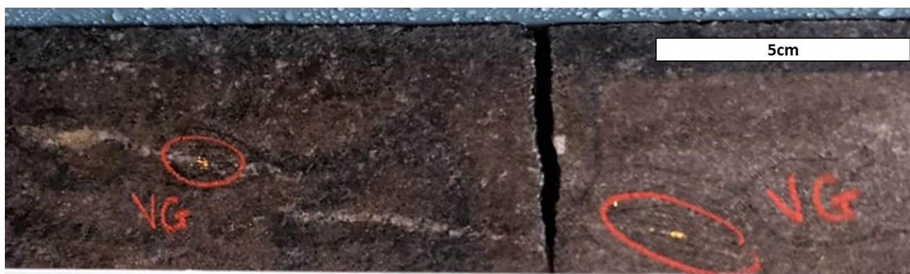
Figure 1. Visible gold occurrence in RBDD003 drill-core, at 241m. Visible gold does not characterise all mineralised intercepts at Redback. Note that there are reports that visible gold was encountered in several drill-holes by the former owner. These have been validated both by observation of remaining core and core photos.

Drill-holes RBDD001 – 003 were designed to pass through the prospective corridor of deformed ultramafics situated between the eastern and western felsic intrusives (Figure 2 & Figure 3). The felsic intrusives are not mineralised, although they do exhibit strong deformation fabrics and alteration.