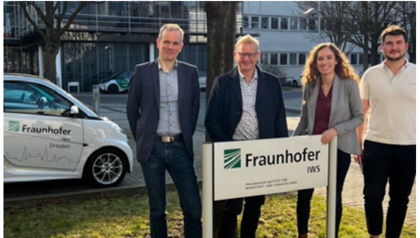
Fraunhofer is the largest research organisation in Germany with over 30,000 staff.

We enjoyed a very successful trip and look forward to sharing developments as these valuable relationships progress.