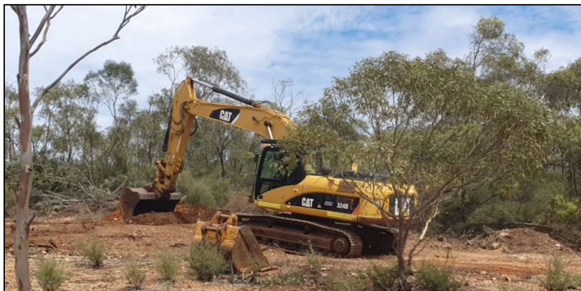
Figure 1: Excavator onsite beginning the trenching program.