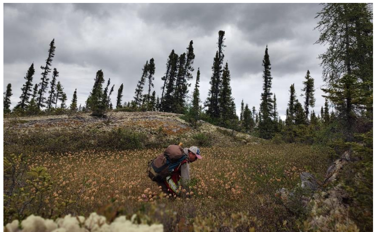
Photo 1 - 3. Koba's team on the ground, conducting the inaugural prospecting and sampling program at the Harrier Uranium Project, Newfoundland and Labrador, Canada