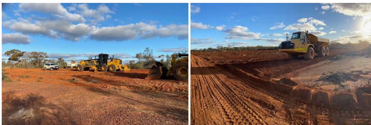
Figure 4 & 5: Clearing at Myhree.