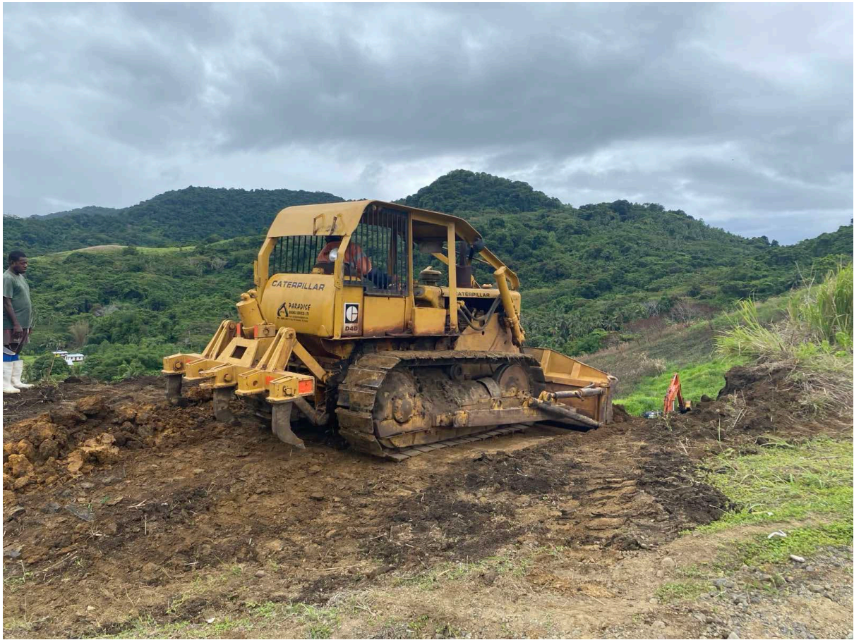
Track and drill pad construction underway at Viani.