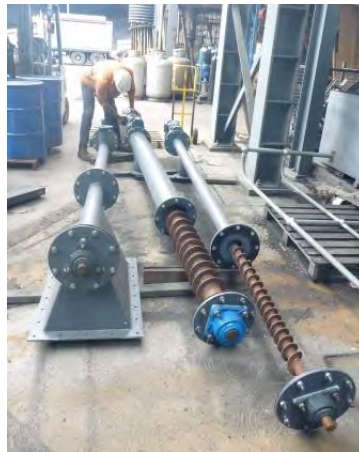
Inspecting three of the solids screw feeders