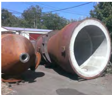
Refractory-lined fluid bed vessels for gasification and metallisation

During March 2014, six solids screw feeders were delivered to the Plant and are ready for installation. Four will be used to discharge solids from product and raw material silos that were installed adjacent to the iron briquetting area in 2013, and two will be used to blend and convey feed materials to the briquetter.