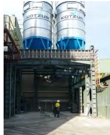
A screw feeder will be installed on each of the silos