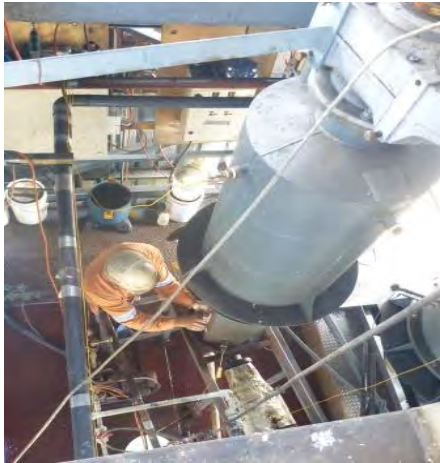
View of pilot scale fluid bed evaporator from upper level