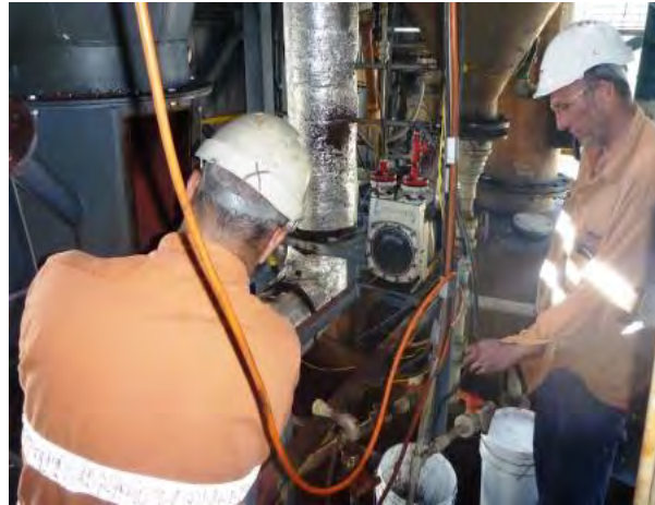
Adjusting slurry feed pump to fluid bed evaporator during pelletising operations