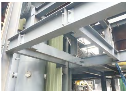
Completed installation of Level 6 beams

Fabrication and painting of the steel support beams for Level 9 of the North Tower is underway. The new beams will be installed during April 2014.