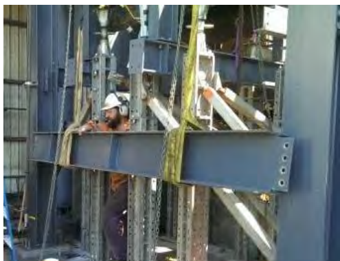
Installing the main support beams