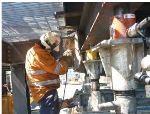
Preparing for installation of support beams for the North Tower

During March 2014, eight critical support beams that were fabricated the previous month were installed in Level 6 of the North Process Tower. The North Tower will house the EARS acid regeneration and iron reduction/metallisation section of the Plant, which comprises four fluid beds (evaporation/pelletisation, pyrohydrolysis, gasification and iron reduction) and two stoves (for heat recovery).