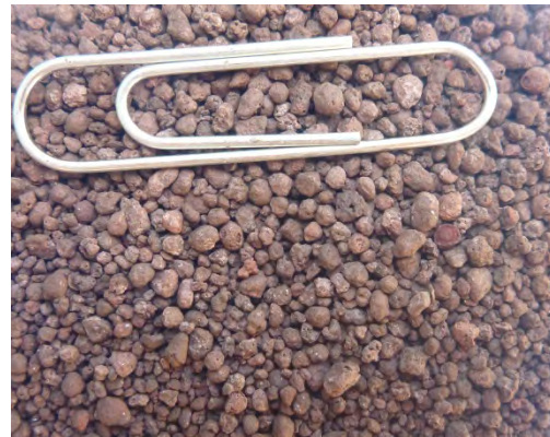
Detail of iron chloride/iron oxide pellets (1-4mm in diameter)