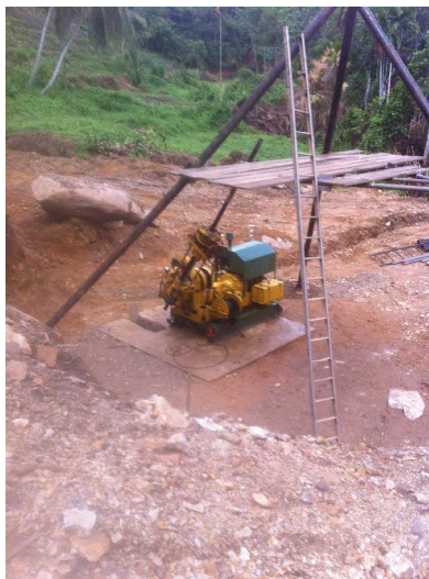
GSMB drill rig located at DH1

The drill rig from the Geological Survey and Mining Bureau (GSMB) has arrived on site and is set up on DH1 location. Mobilisation and setup has been hampered by severe rain and localised flooding during over last week. Drilling is now expected to commence on or around the 11 th of June.