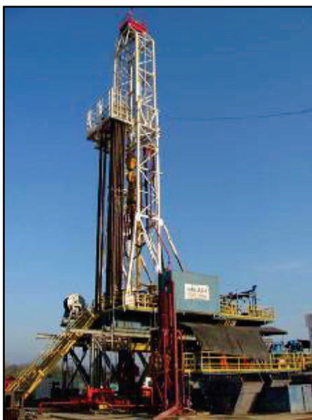
AD-1 drilling Rig

As demonstrated by the Operator elsewhere in Thailand, any discovery at L20/50 can be very quickly commercialised with crude oil transported by truck to one of Thailand's nearby oil refineries for sale.