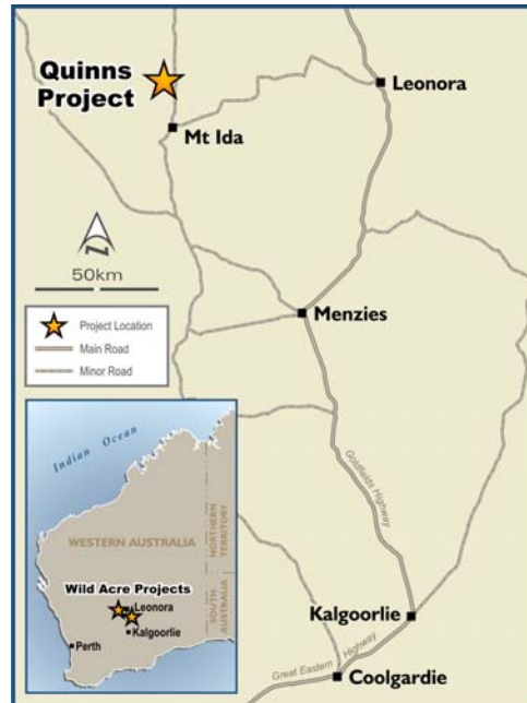
Figure 1: Quinns Project Location Map