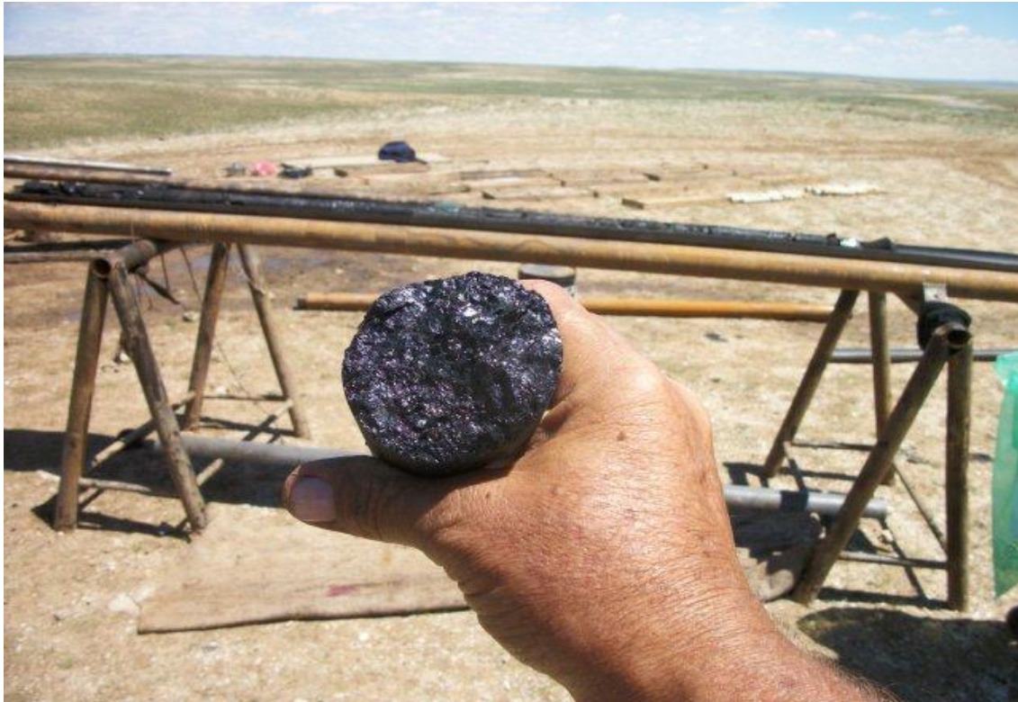
Core sample from BTE-2 indicates good levels of vitrinite.

Exploration drilling has also been undertaken on the South Gobi licences, with coal intersected on one of these licences. Nationwide diesel shortages in Mongolia, has limited our ability to undertake planned trenching in the South Gobi. Although these tenements remain prospective, priority is being given to the Ovorhangay licences presently being drilled.