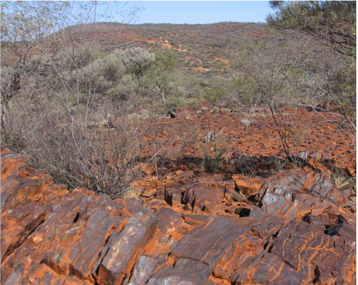
Iron formation with drilling in the background Telecom Hill