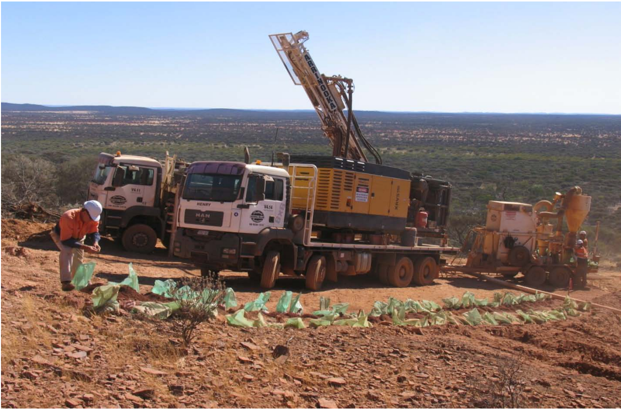
Drilling on Telecom Hill with samples in foreground