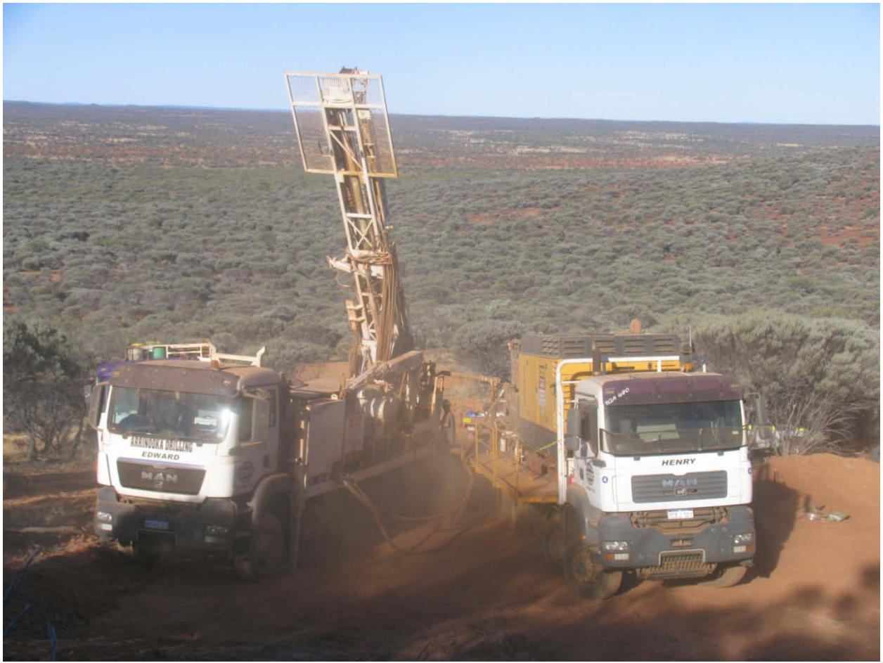
Drilling in progress Telecom Hill